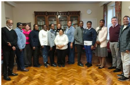
Delegates from the Religious Formation Ministry Programme at Safeguarding training.

Dear Colleagues, Welcome to our first Newsletter of 2026. As we move into the spring, I am reminded of the vital importance of our collective efforts to ensure the safety and well-being of children within our Church community. This season, marked by reflection and renewal, offers us a moment to look back on our progress and forward to the work that remains.