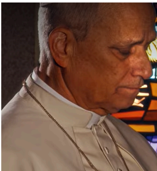
Pope Leo in his video message released 31 st March 2026

This year, Pope Leo's monthly prayer intention places a special spotlight on priests. In his video message, he invites the whole Church to pray for those who serve in ministry—acknowledging both their generosity and the challenges they face. He speaks of those who “work hard and sometimes feel tired or lonely,” and he urges the faithful to support them with prayer, encouragement, and closeness. The Video released on the 31 st of March 2026 can be viewed here: Video Message “Pray with the Pope” — April: For priests in crisis - Calendar of Activities | Vatican.va