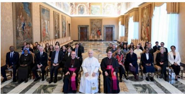
Pope Leo meets the members of the Pontifical Commission for the Protection of Minors on 16 th of March 2026

Pope Leo XIV acknowledged the Commission's work, recognising that much of it takes place away from public view and often in demanding circumstances. At the same time he emphasised to the Commission that procedures alone are insufficient. What truly matters is the formation of a culture of care: a way of being that listens with patience, responds with integrity, and fosters communities where every person—especially the vulnerable—may live without fear.