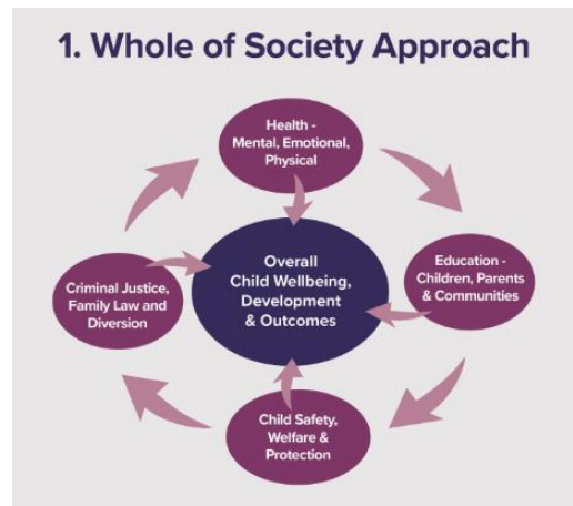
Taking a Whole of Society approach to tackling Child Sexual Violence

This report asks us all to acknowledge, understand and discuss child sexual violence.