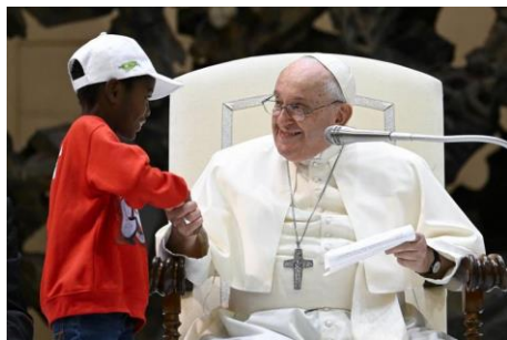
Pope Francis greets a child on the 1 st November 2024 at a gathering which featured children from 84 different countries, part of an event sponsored by the Dicastery for Culture and Education dedicated to the theme "Let Us Learn From Boys and Girls."

Pope Leo XIV, the 267 th successor to St Peter, delivered his first mass as pontiff on the 9 th of May 2025. We have great hope he will continue and indeed enhance the safeguarding work undertaken by Pope Francis.